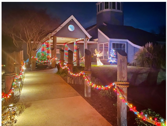
The Landing...it's a way of life!