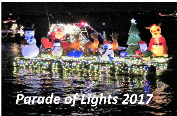
Parade of Lights 2017

This newsletter contains articles about our National Night Out in October, the upcoming NYE Party, some articles of Thanks from our neighbors and the HOA Manager's article. Note that the Eagle Mountain Lake Parade of Lights is on Saturday December 1 st and begins after dark at the marina across from Augie's. The parade route plans to pass down the channel to Harbor One that should be viewable from our park by our Landing boat ramp. We hope that everyone is enjoying the holidays with family and friends. If you have suggestions for future articles, please contact our Manager or the editor.